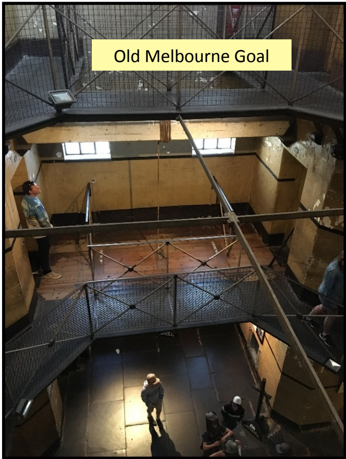
Old Melbourne Goal