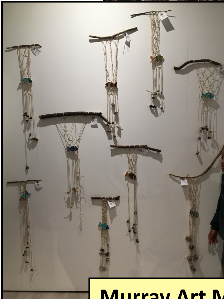
Murray Art Museum Albury