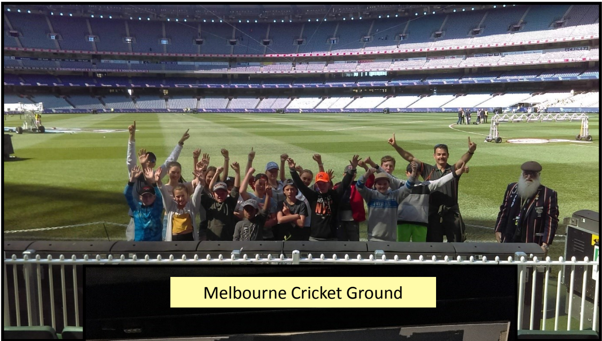
Melbourne Cricket Ground