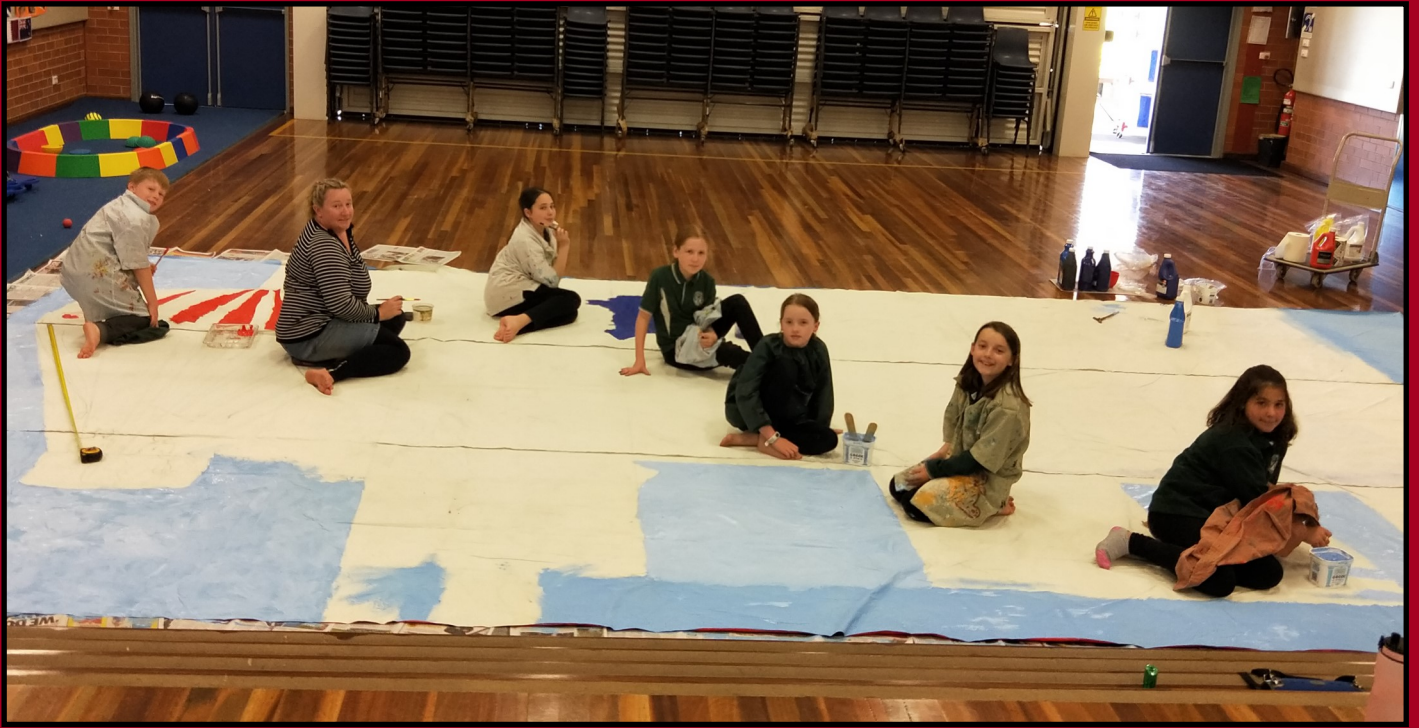
Students helping with the production backdrop